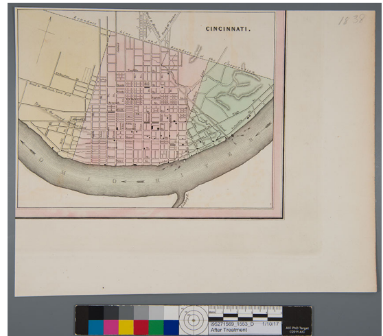
i95271569_1553_D01N - After surface cleaning