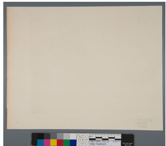
i95271569_1553_D02N - After surface cleaning