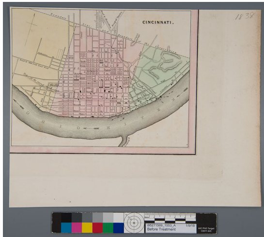
i95271569_1553_A01N - Before surface cleaning