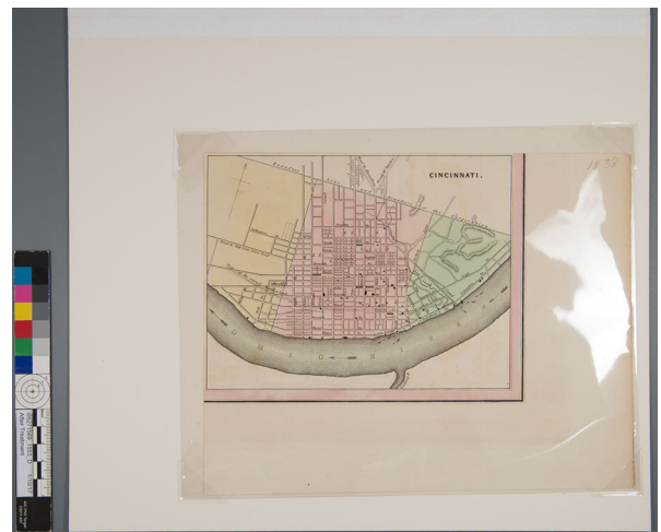
i95271569_1553_D05N - After treatment, map housed in L-sleeve and custom window mat