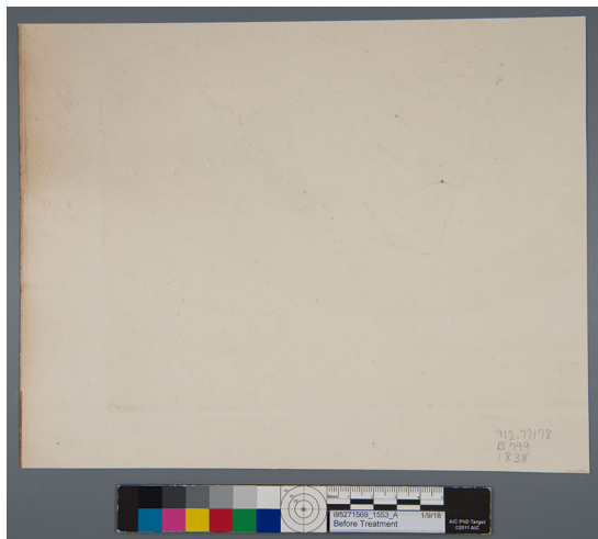
i95271569_1553_A02N - Before surface cleaning